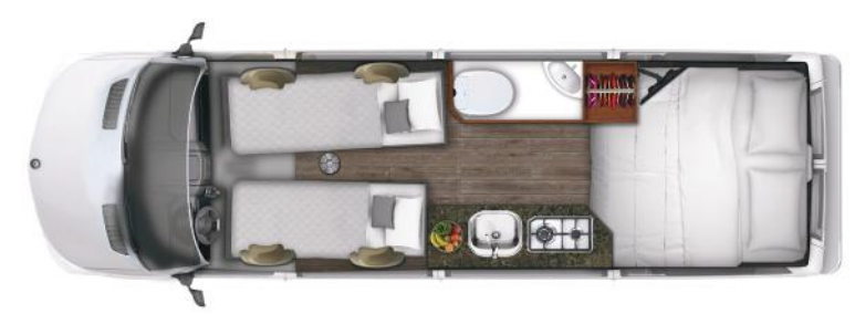
Interior floorplan of RS Adventurous during the evening