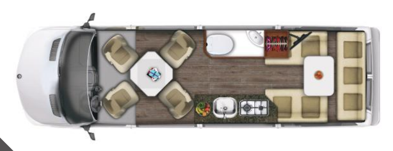
Interior floorplan of RS Adventurous during the daytime

Take a step into your beautiful new RS Adventurous by Roadtrek. As you turn from your driver's seat, you'll find a pop-in table and second row seats where you'll be able to enjoy a card game or a nice meal. Looking ahead to your kitchen, prepare a delicious meal on your 2-burner propane stove, and keep your groceries fresh in your 3.6 cu. ft refrigerator. As you make your way through the galley, you'll find a comfortable and spacious permanent bathroom with stand-up shower. End your day on your power leather sofa that easily converts into a king size bed, and watch your favorite movie on the 24" flat screen TV and entertainment center.