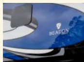
Waterfall Paint Scheme