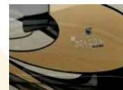
Silver Sand Paint Scheme

Some interior furnishings not included. Some photos shown in literature have optional equipment. All options may not be available in every model. Because of progressive improvements, specifications, standard and optional equipment are subject to change without notice or obligation. For a complete and up-to-date list of available options and specifications, as well as Vanleigh's full line of RVs, visit vanleighrv.com .