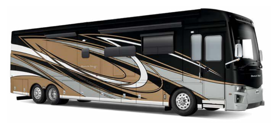
WYLIE EXTERIOR Awning Color: Charcoal Tweed

NORFOLK EXTERIOR Awning Color: Charcoal Tweed