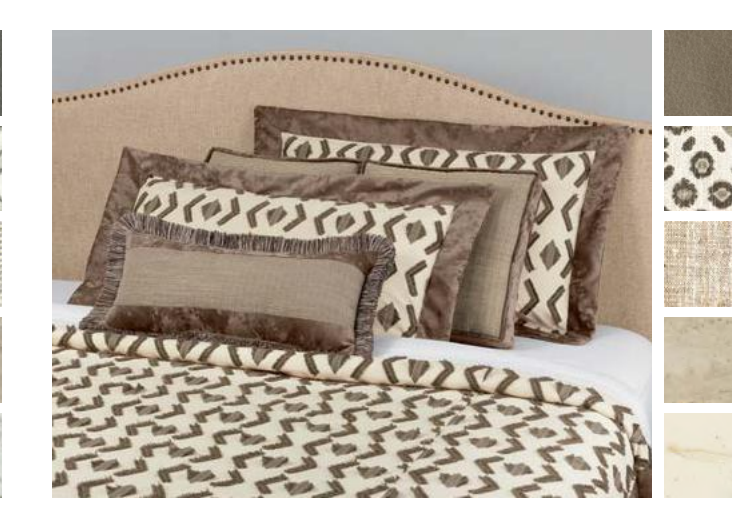
FULTON INTERIOR a. Furniture/Fabric b. Flooring c. Counter Top