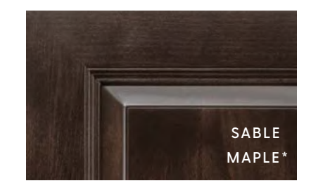
*Available Hardwood Frame