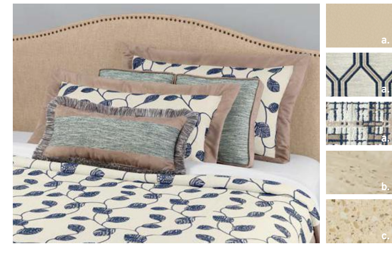
NORFOLK INTERIOR a. Furniture/Fabric b. Flooring c. Counter Top