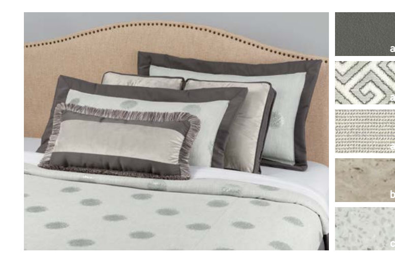
CHATHAM INTERIOR a. Furniture/Fabric b. Flooring c. Counter Top