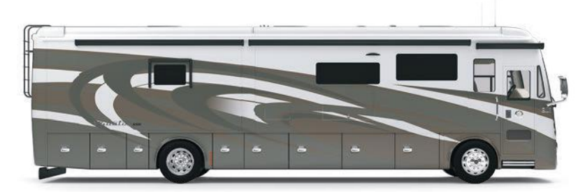
G9 FROSTED GRANITE