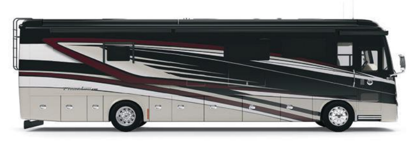
G10 MAROON CORAL