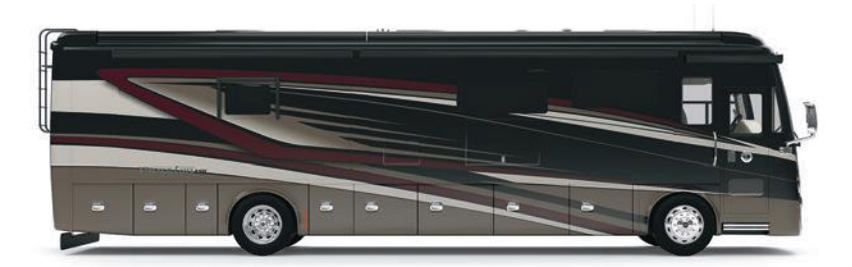
G10 SUNLIT SAND