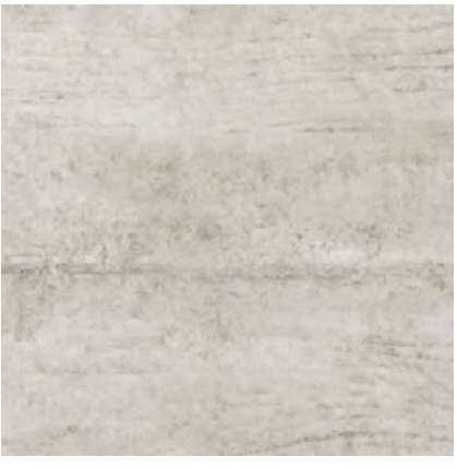
BIANCO NAVARO (O)