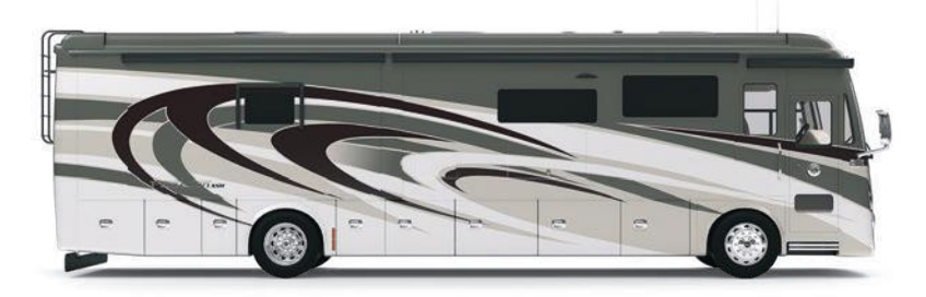
G9 WHITE MAHOGANY