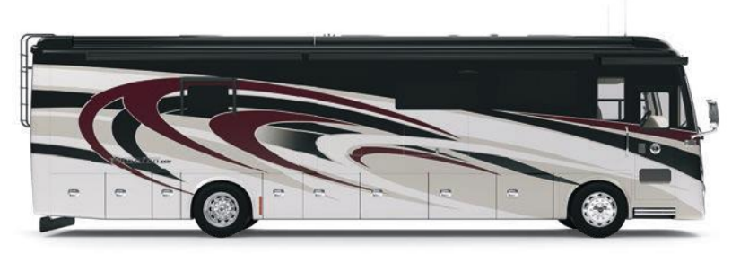
G9 MAROON CORAL