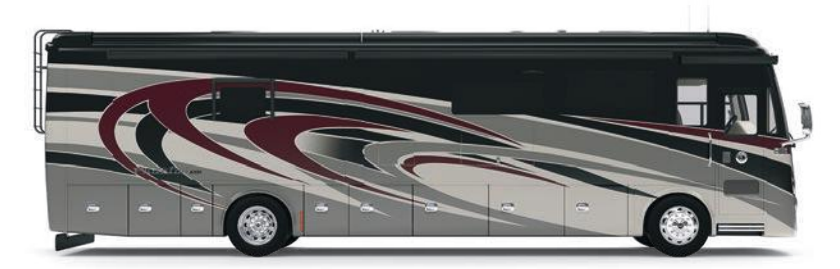
G9 SUNLIT SAND