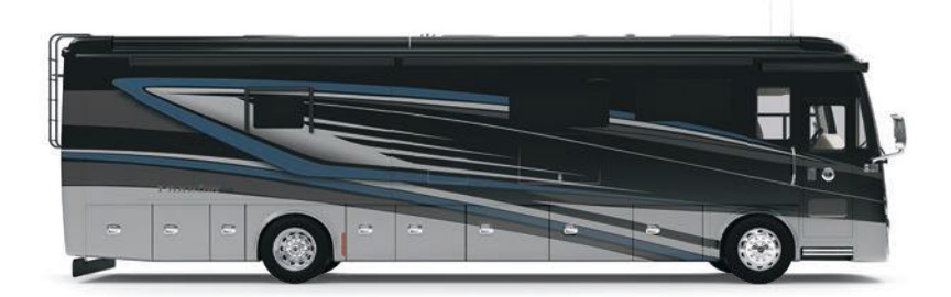
G10 EURO BLUE