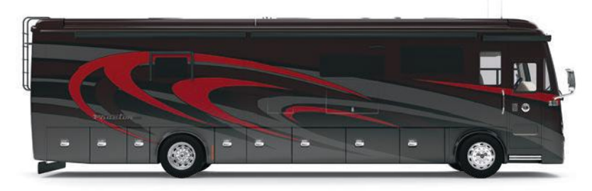
G9 FIRE OPAL