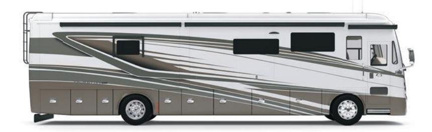
G10 FROSTED GRANITE