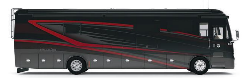
G10 FIRE OPAL