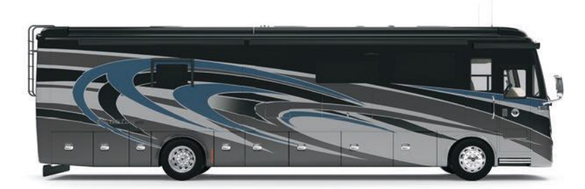
G9 EURO BLUE