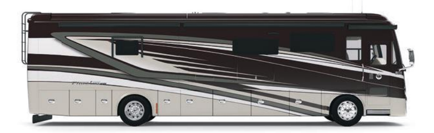
G10 WHITE MAHOGANY