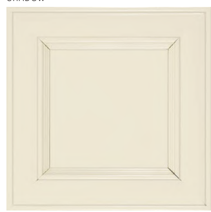
PURE LINEN 1