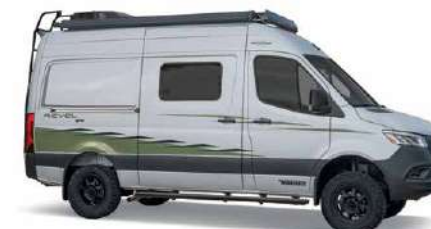
SILVER FOREST WITH GRAPHICS