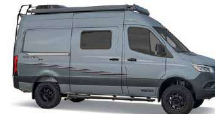
BLUE GREY WITH GRAPHICS