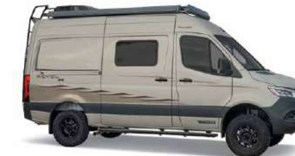
PEBBLE GREY WITH GRAPHICS