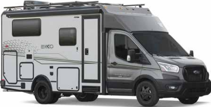
VERDANT II WITH GRAPHICS