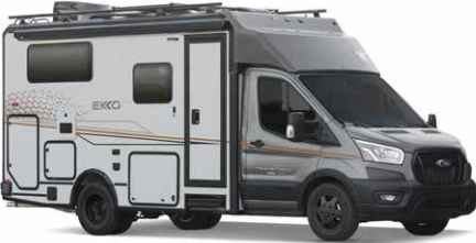
RAW SIENNA II WITH GRAPHICS