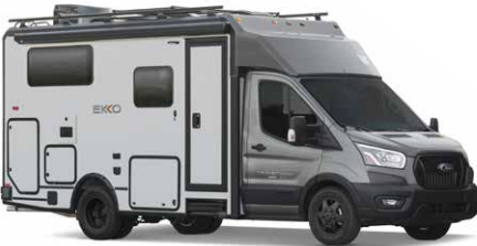
RAW SIENNA II