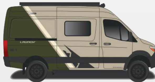
Forest Glade Partial Paint (Sandstone Van Only)