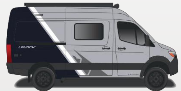
Mystic Tide Partial Paint (Blue-Grey Van Only)