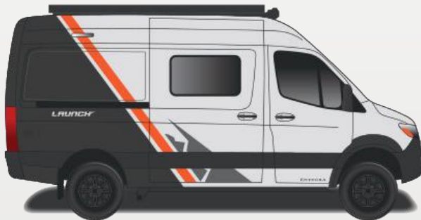
Aztec Partial Paint (Silver Van Only)