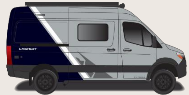
Mystic Tide Partial Paint (Blue-Grey Van Only)