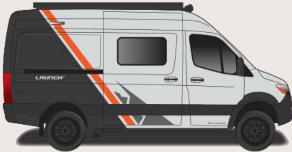
Aztec Partial Paint (Silver Van Only)