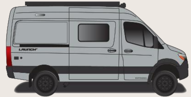
Standard Blue Van