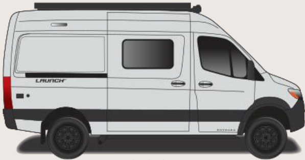
Standard Silver Van