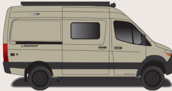
Standard Sandstone Van