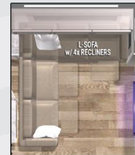
OPTIONAL L-SOFA W/ 4X RECLINERS