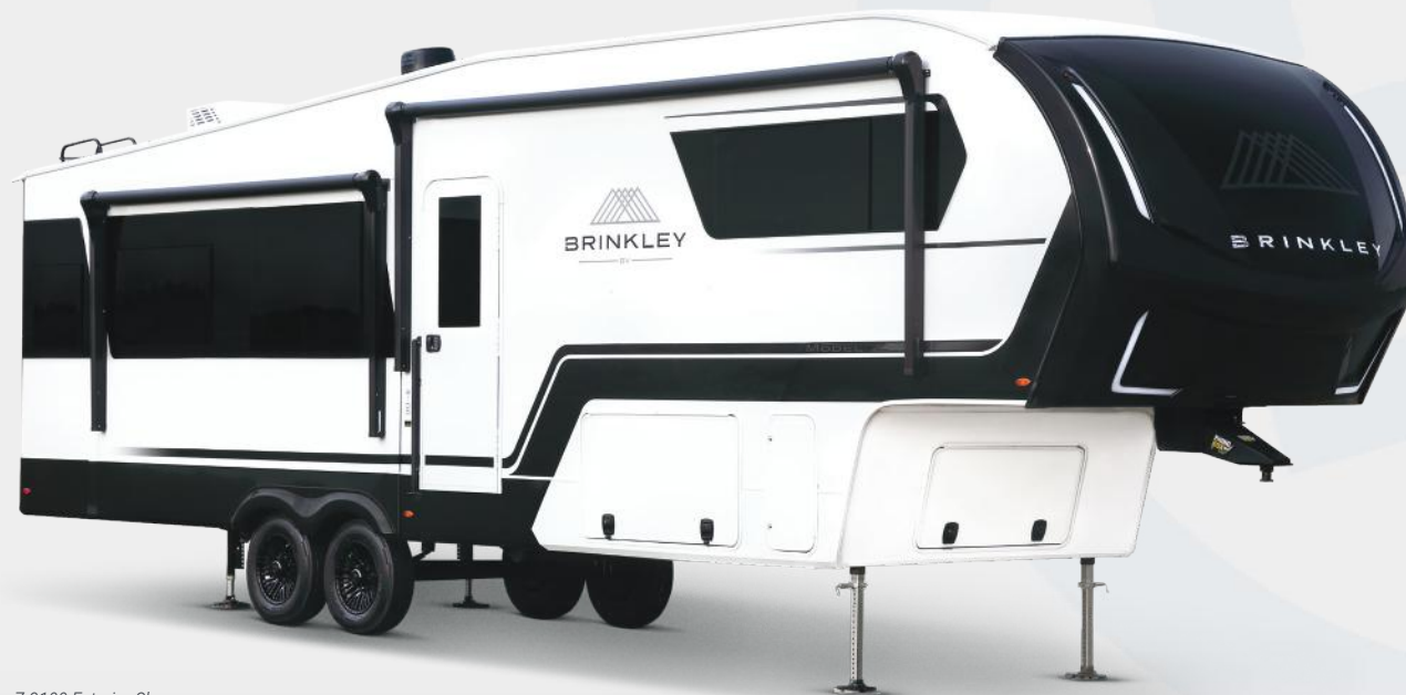
Z 3100 Exterior Shown