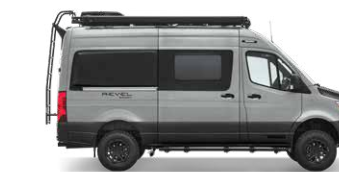
SILVER GREY WITH RAPTOR®

Other exterior colors available are: Selenite and Stone Grey. See website for more details.