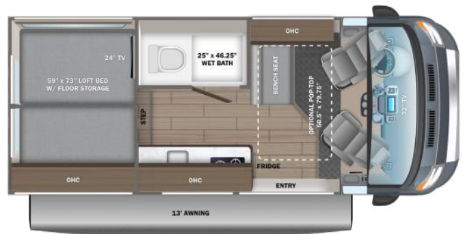
OPTIONS: A, B