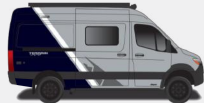
Optional Mystic Tide Partial Paint (Blue-Grey Van Only)