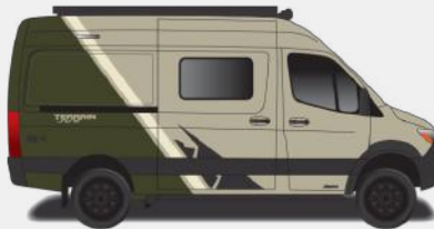
Optional Forest Glade Partial Paint (Sandstone Van Only)