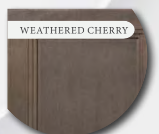
OPTIONAL - CALI COLLECTION